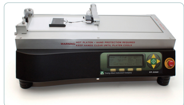
FP-2260 w/ Heated Platen

OPTIONAL: MAP-4 Software Windows 10 Compatible