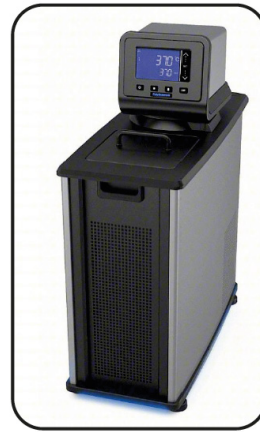
▲ Constant Temperature Circulator (CTC)